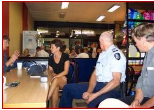
Night walks through the Traralgon Entertainment Precinct