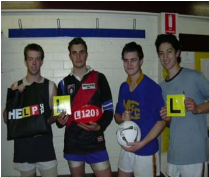
Moe Football Club

The L2P Drivers Education program was recently advised that additional funding has been secured to ensure its continuation. The program is a pathway to this cohort of drivers, through community support, education and practice, to enable them to attain their probationary licence. It aims to help reduce the risks associated with inexperienced drivers and driving, access to resources needed for licensing, and the engagement of at risk youth in the community (i.e. increased opportunities re: employment, building positive adult relationships etc).