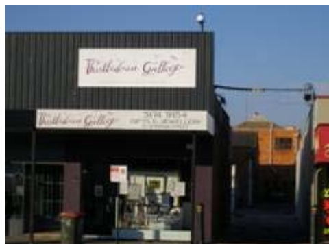
Thistle Down Gallery