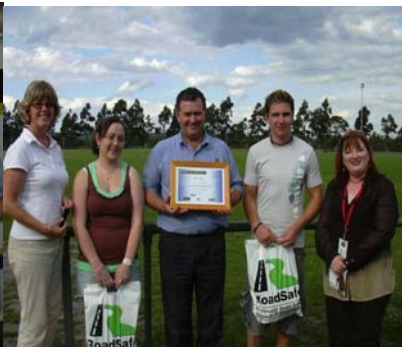
Newborough Football Club