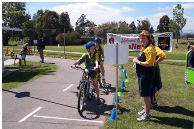
The International Power Traffic School – Bike Ed Challenge

The International Power Traffic School continues to be an important facility for bike education and traffic awareness training for schools and community members throughout the Gippsland region. Children and adults alike utilise the facility in large numbers on a regular basis. The facility has also been utilised for motorised scooter and other road safety training.