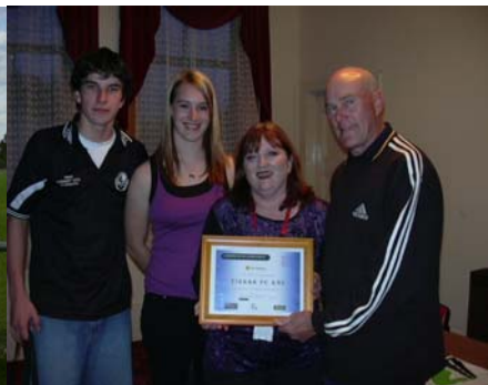
Yinnar Football Club