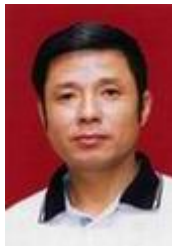
Photo of leader(s):

Professions: part-time or full-time : 5 full time professions, 78 part-time professions